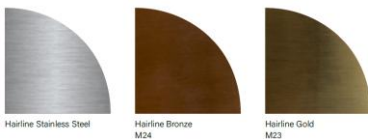
Hairline Stainless Steel